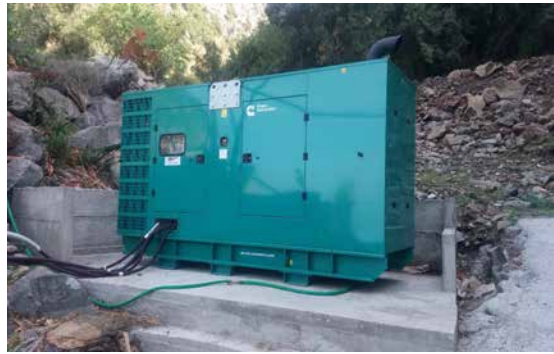
Images: new temporary container shed to house equipment until the building project can resume; and new 275 kva generator (October 2019).