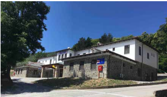
Image: the Mount Athos Health Center.

With the outbreak of the Coronavirus, it quickly became clear that the Health Center in Karyes needed to acquire diagnostic equipment and supplies. The small clinic had only just moved into its new, permanent quarters a short time before, when the virus struck.