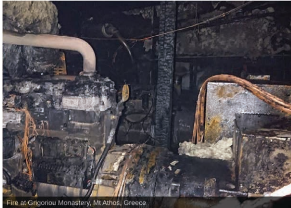
Image: Damaged electromechanical equipment after the Grigoriou Fire

MAFA has continued its support to the Holy Monastery of Grigoriou, helping to fund the repairs and rebuilding that were critically needed following the fire that destroyed their electromechanical facility two years ago. In the first half of this year, we made our second contribution, making good use of our emergency aid fund. MAFA's total contribution was all made possible by the generous donations of American members of the Friends of Mount Athos and growing numbers of donors that have discovered MAFA and have enthusiastically supported our mission.