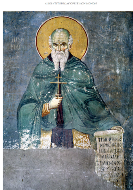
Ἄγιος Ἀθανάσιος ὁ Ἀθωνίτης, συγγραφεὴς, μαζί τοῦ Πρωτάτου, Μανουὴλ Πανσελίνος (ἑκδοξ.), περ. 1300

As announced in Newsletter 4 , MAFA has joined with the Mount Athos Center (Agioritiki Estia) to publish an English translation of the Mount Athos Center's spectacular 415-page volume, Hagiorite Panagion. The Chorus of the Saints on Athos , under the editorship of the respected and internationally recognized scholar, Symeon A. Paschalidis ( https://www.agioritikiestia.gr/en/hagioritikon-panagion-ton-en-atho-ho-choros ). The above image (from the original Greek version, pages 52-53) shows the beginning of the life of Athanasios the Athonite, founder of the Great Lavra Monastery († 1001/4), illustrated by the icon of Athanasios from the wall of the Protaton church attributed to the painter, Manuel Panselinos.