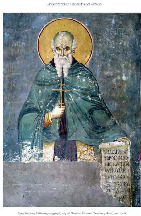
Ἄγιος Ἀθανάσιος ὁ Ἀθωνίτης, κτίτωρ τῆς μονῆς Μεγίστης Λαύρας († 1001/4), σελ. 1300.

As announced in Newsletter 4 , MAFA has joined with the Mount Athos Center (Agioreitiki Estia) to publish