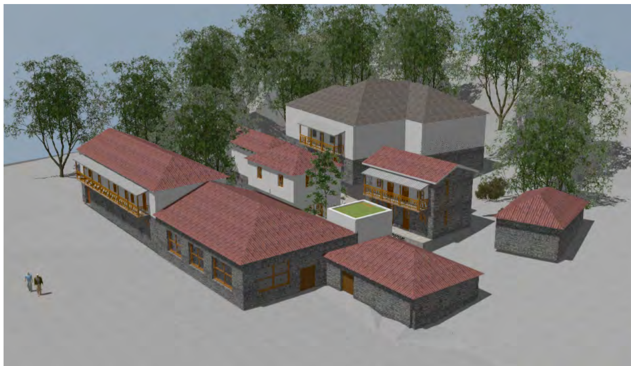
Image: The proposed building complex at Grigoriou

We are pleased to report that the MAFA contributions toward the Monastery of St. Grigoriou Appeal helped the monastery replace some of the equipment damaged in the 2019 fire, restoring life in the monastery to normalcy. However, much remains to complete construction for the long term. As such, MAFA's Grigoriou Appeal is still open . Remaining are the purchase of a modern 200 kw wood boiler to replace the last of the damaged equipment, and new construction to provide housing for the new electro-mechanical equipment and living space for engineers and workers employed by the monastery. The new construction projects are a critically important part of the overall project, positioned at a distance from the Monastery to protect it from any future issues and to facilitate quiet at the Monastery itself.