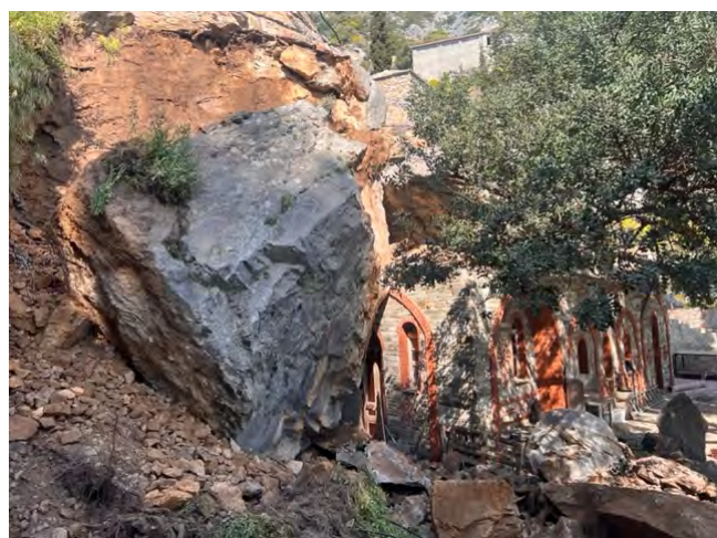
The church crushed by massive boulders loosened by the landslide

In May 2022 a landslide crushed the dome and damaged the walls of the church of the Kalyva (a small monastic cell) of the Dormition, a dependency of the Skete of Little St. Anne on Mount Athos, which itself belongs to the Great Lavra monastery. Named the Church of the Cave of the Holy Fathers Dionysios the Rhetorician and Mitrophanes, it was dedicated to the first ascetics in this part of the Holy Mountain that later became the Skete of Little St. Anne.