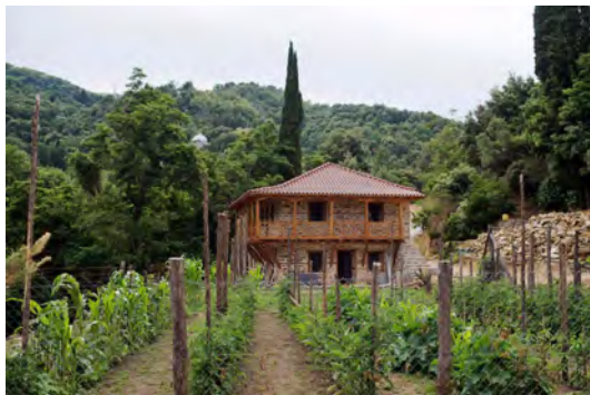
The Axion Estin Cell, a dependency of Pantokrator Monastery, is located not far from Karyes. Photograph of the completed phase 1, courtesy of Graham Speake, The Friends of Mount Athos

The Axion Estin Cell renovation project is entering phase 2, which includes building new cells for the monks (the old ones are collapsing), a new kitchen and a guest house for pilgrims. MAFA was able to kick off the fundraising for this phase with a contribution of $20,000 made possible by our generous Canadian donor plus additional funds from our year-long appeal shared with the Friends of Mount Athos.